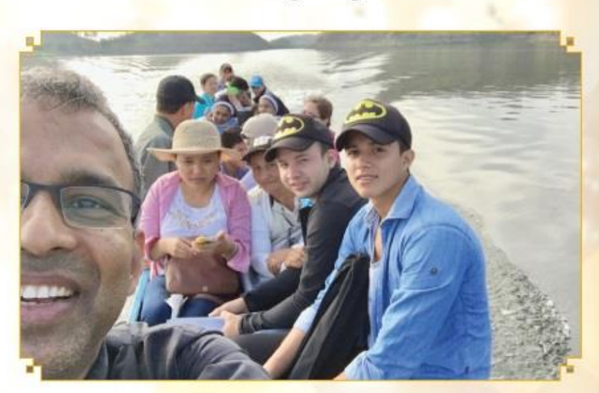
Trip to a Mission Station inside a Reservoir Area in Ecuador