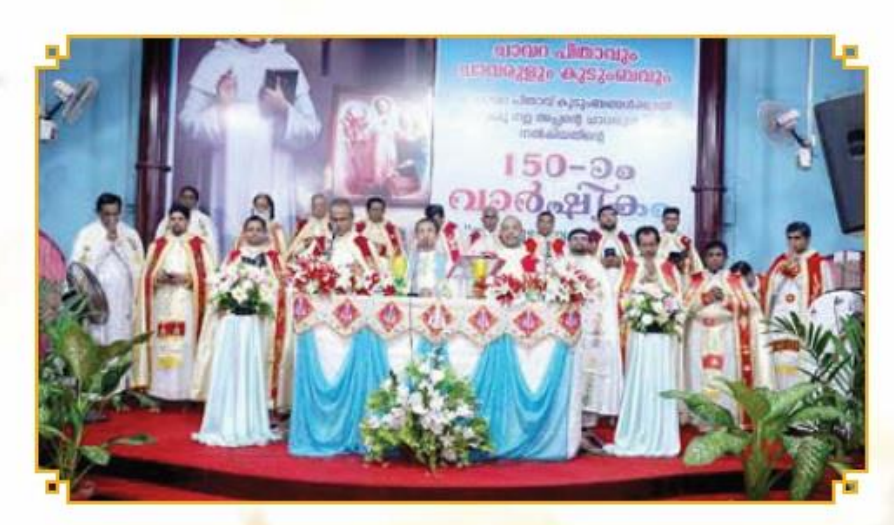
150 Years of Chavarul at Jerusalem Retretat Centre, Thrissur