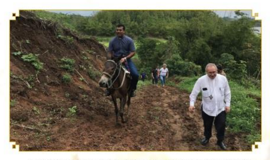
A Bishop and a Priest Reaching out to Mission Stations in Ecuador through Tough Terrains