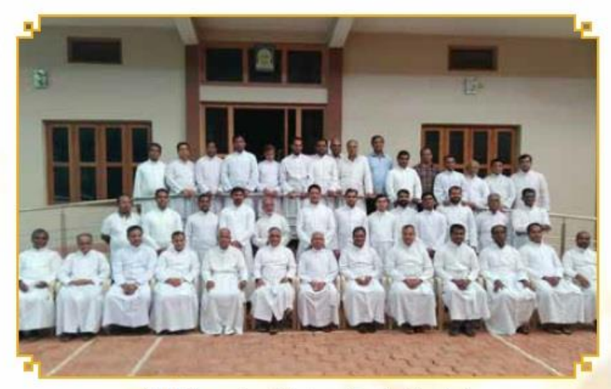
CMI Superiors' Animation in Jagdalpur