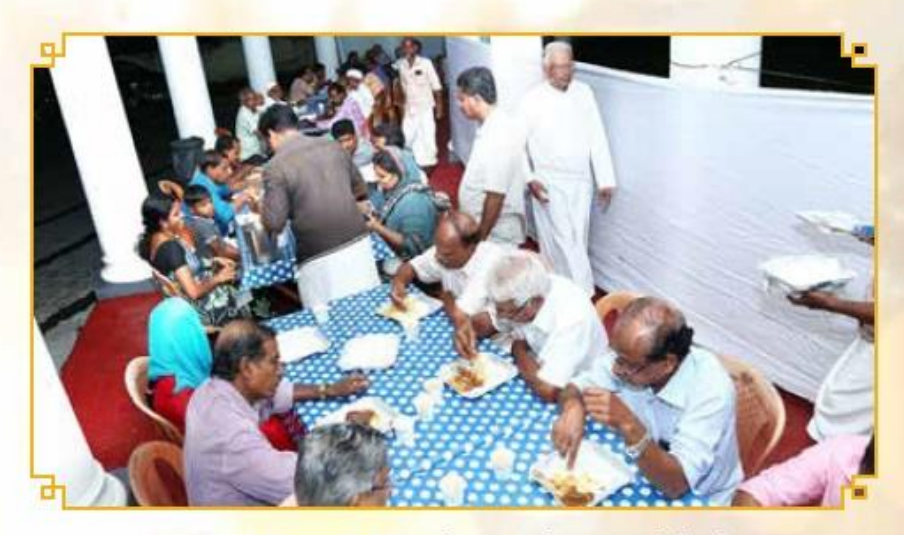
Iftar Dinner at Mar Thoma Shrine Azhikode