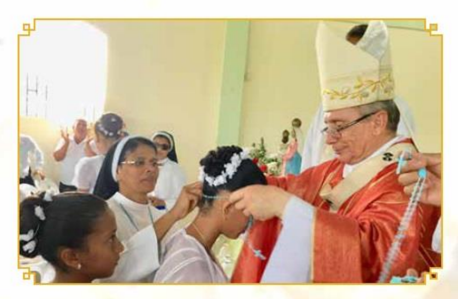
Perpetuating Marian Devotion in Ecuador