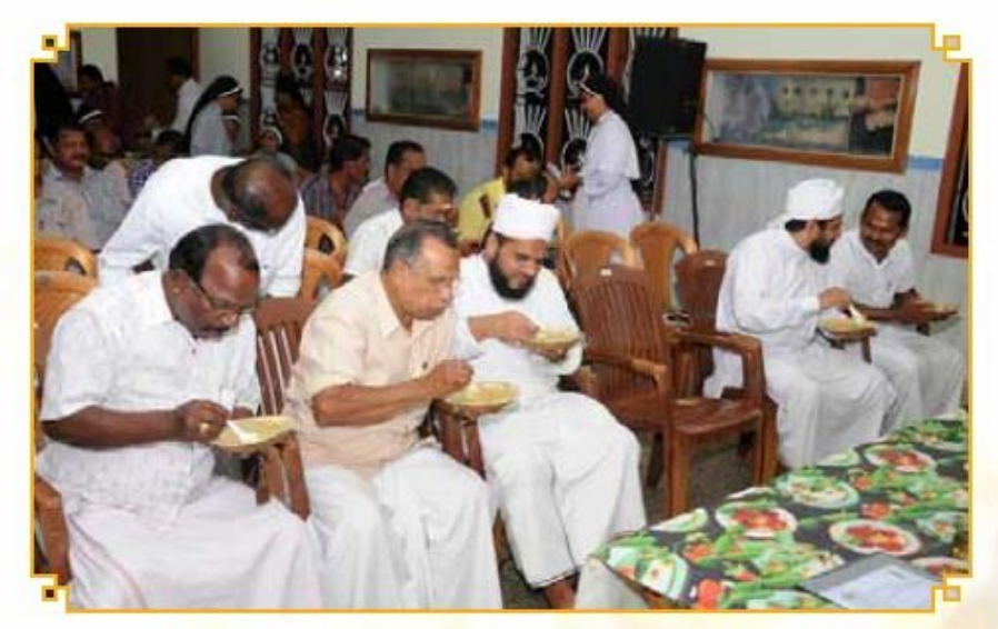
Celebrating Ramayana Month with Karkkidaka Kanji at Azhikode