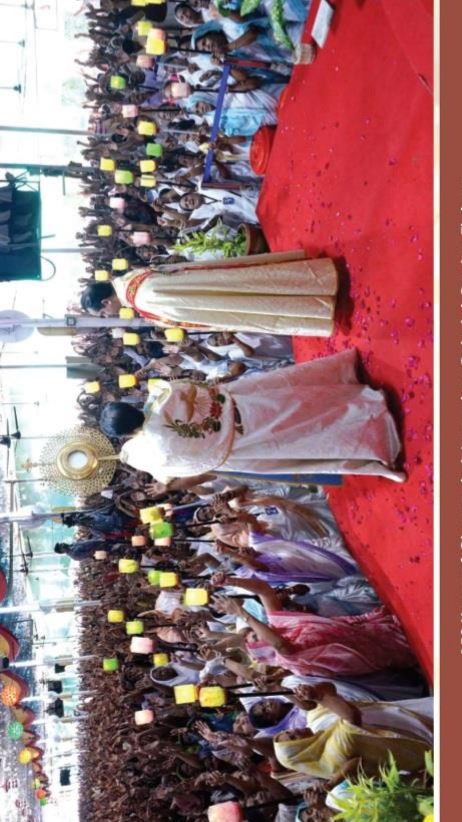
150 Years of Chavarul at Jerusalem Retretat Centre, Thrissur