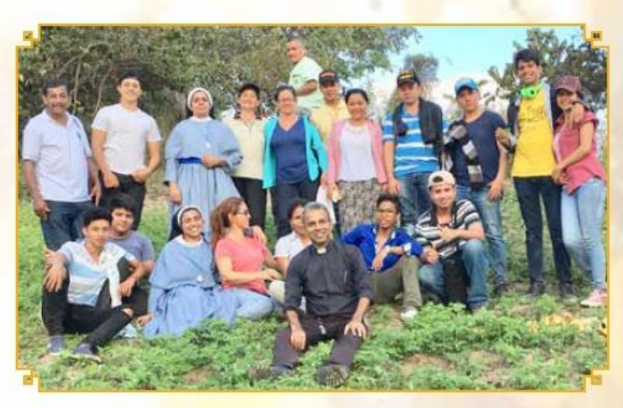
Ecuadorean Missionaries during ar Pastoral Visit