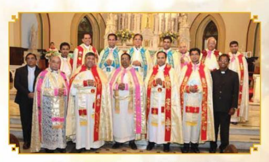
Saint Chavara Feast, USA, November 2017